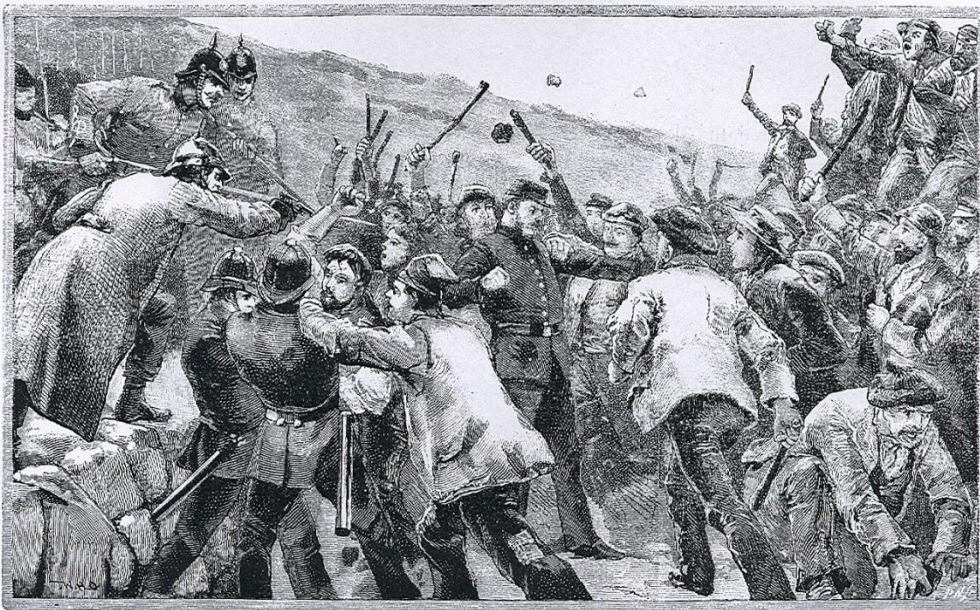
POLICE AND MARINES SEIZING THE RIOTOUS CROFTERS. CROFTERS OF LEWIS, IN THE HEBRIDES.